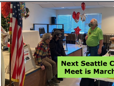
Next Seattle Chapter Meet is March 13th